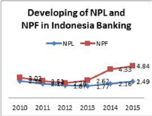
Figure 1: Developing of NPL and NPF in Indonesia Banking

To know the condition of NPL and NPF in Indonesia Banking can be seen in the following graph: