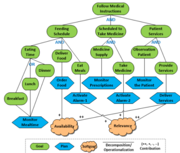
Figure 2. Patient monitoring system modeling.

The adaptation mechanisms required for this case consist of (a) adaptation to changes and growth of context information related to patient feeding activities, (b) adaptation to changes and growth of context information related to the activity of taking medicine for the patient. The system requirement of this case can be illustrated as follows: