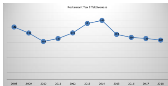
Fig-2: Development of Restaurant Tax effectiveness

very effective. This explains that the Tasikmalaya City BPPRD has tried optimally in collecting restaurant tax from taxpayers.