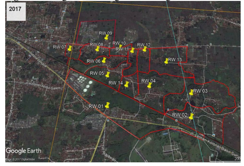
Figure 1. Google Earth image of Sukanagara subdistrict

Based on the data (subtracting the land area in 2017 from the land area in 2013), the result is a decrease of agricultural land area in the last five years in Sukanagara Village by 13 hectares, if the average reduction of agricultural land area was 2.6 per cent, per year. This was related to the process of housing construction, roads, and economic facilities that required land, therefore converting agricultural land in Sukanagara Village. The land changes be identified in the image of the following Google Earth results (figure 1).